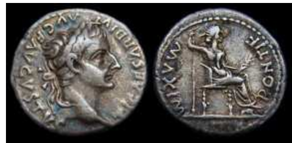
Ti[berivs] Caesar Divi Avg[vsti] F[ilivs] Avgvstvs” (“Caesar Augustus Tiberius, son of the Divine Augustus”),

it says on the coinage next to his face, “the divine Caesar.”