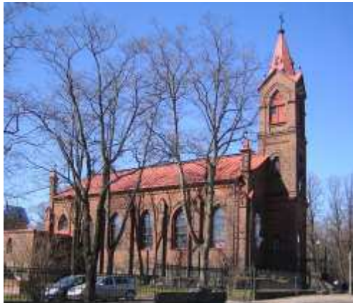
St Henry's Cathedral Helsinki

Once I found it, I had to sort out the way to go there via public transport and that meant an hour each way. Finally I was there: Entering the Church I knew only one thing, the Christ in the Eucharist was exactly the same one I had left at home! And there I could pray using my language and this time I would be understood.