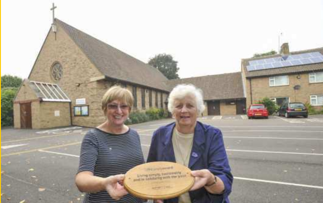
The Parish's LivingSimply Award and the Solar Panels