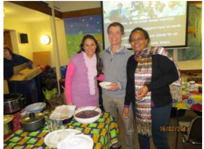
The Emmaus Meal

Ideas for a more Sustainable and Simpler living in our own lives have been offered in Lenten Calendars and encouragement offered via a Wall of Promises. The parish has installed solar panels, improved recycling, avoided the use of disposable items and installed a cycle rack. The garden has a regular band of helpers who have installed bird boxes and encouraged wildlife and we have held two Growing and Sharing afternoons to encourage each other and learn more about growing our own food.