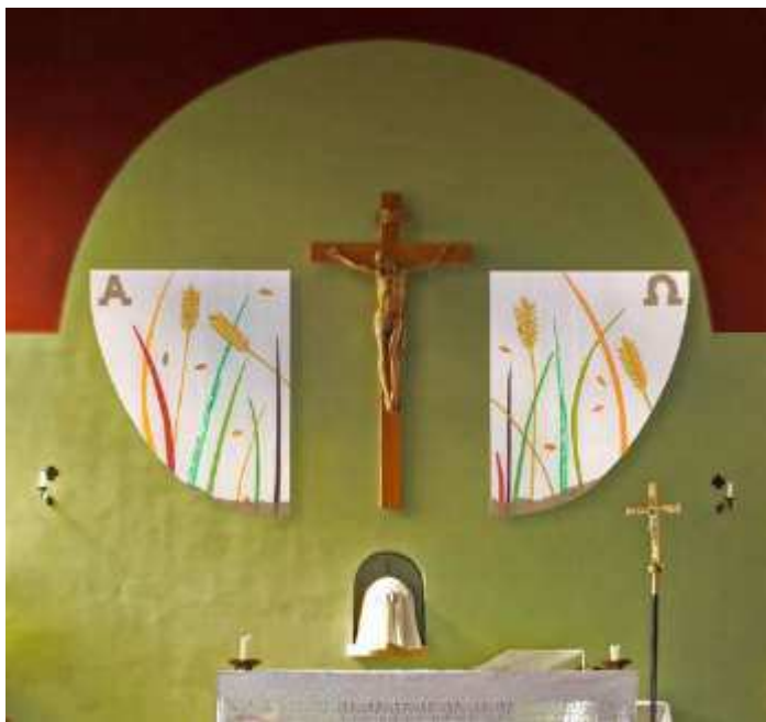
Example 2 – the Tapestries near the Crucifix but outside its lines