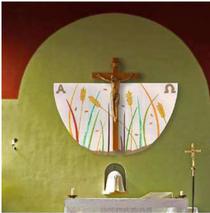
Example 1. The two tapestries close to the Crucifix.