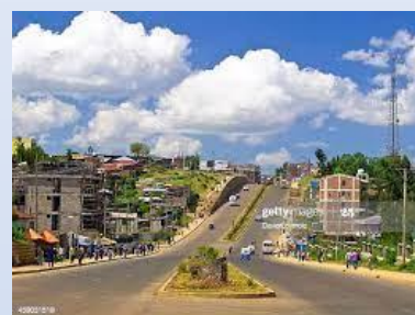
Debre, Tabor, Ethiopia