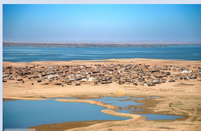
Wadi Halfa, Sudan