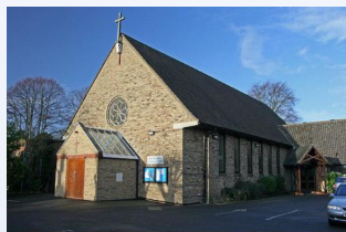
St Laurence's Church