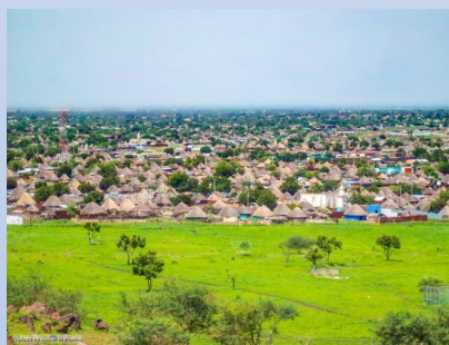
Al Qadarif, Sudan