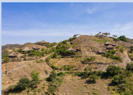
Chifra, Afar, Ethiopia